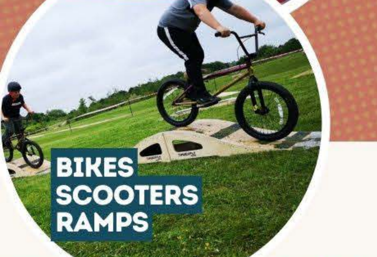
BIKES SCOOTERS RAMPS