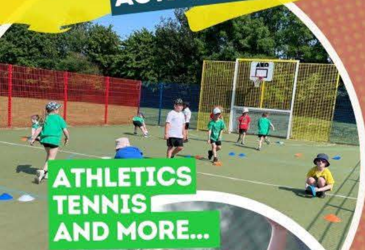
ATHLETICS TENNIS AND MORE...

barnsley.gov.uk/whatsyourmove/summerholidays