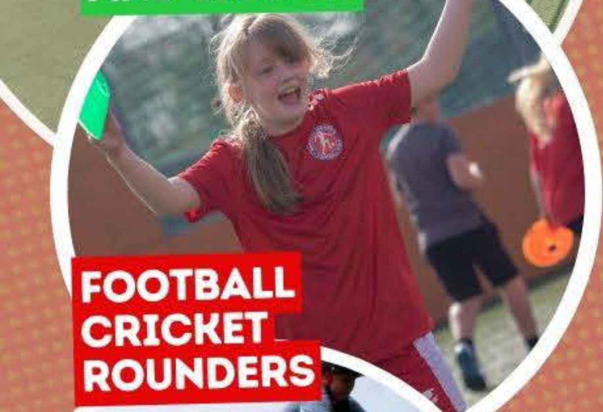
FOOTBALL CRICKET ROUNDERS